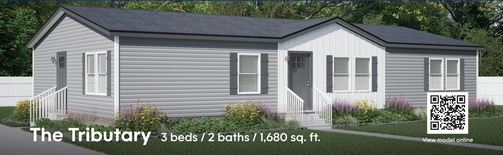
The Tributary 3 beds / 2 baths / 1,680 sq. ft.