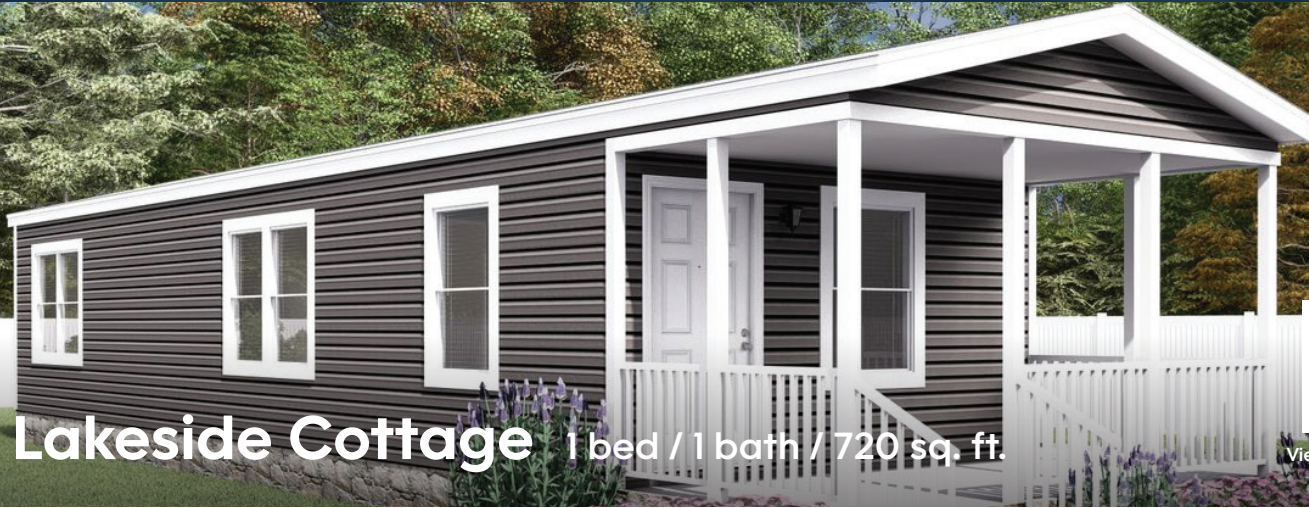
Lakeside Cottage 1 bed / 1 bath / 720 sq. ft.